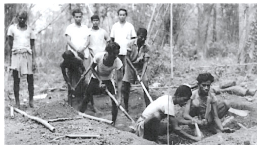
Excavation at Daojali Hading (1961)

These finds firmly establish the northeast as Neolithic. Both the stone tools and the potsherds however bear remarkable resemblances to the ones found in the established Neolithic sites in Southwest China and Southeast Asia. Daojali Hading is therefore considered to be an extension of the 'Corded Ware Zone' of south and south-west China and the southeast Asia, as far as pottery is concerned. With regards to the grounded axes and shouldered celts too, (superior) versions of the same are found in the south and southwest Chinese Neolithic sites. Also, at least in the Naga Hills and in Arunachal, Neolithic axes made of jadeite were among the surface finds – a material which is locally unavailable – indicates import of tools/ material from Neolithic cultures in China, most probably in Sichuan in south China.