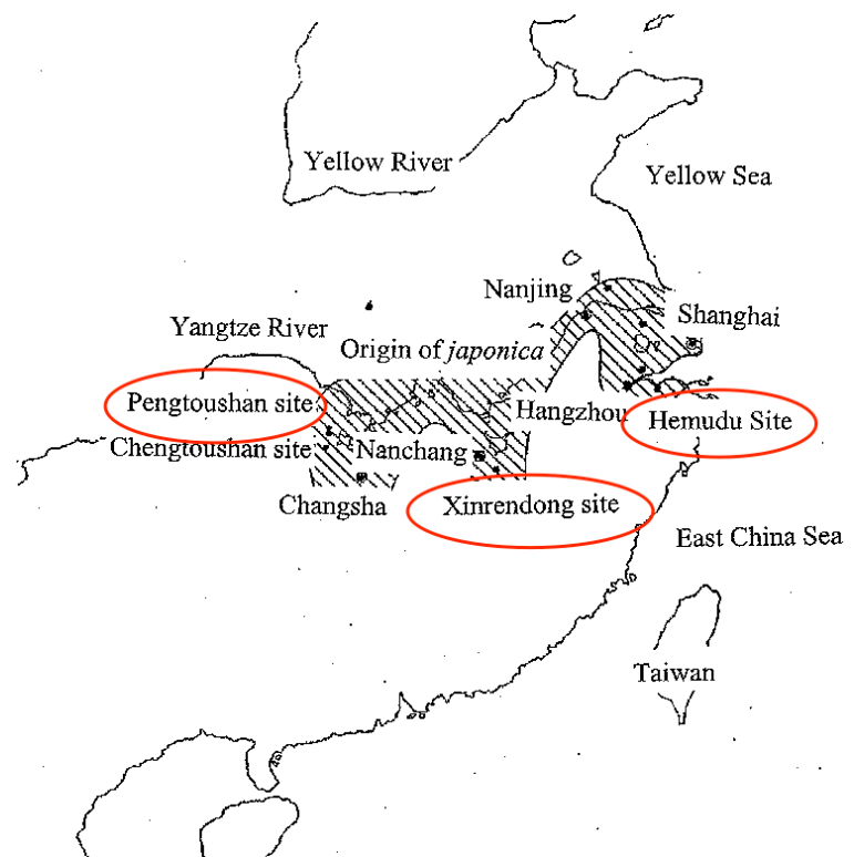
Figure showing sites where ancient rice remains were found.

Interestingly, it has been conjectured that Hemudu was peopled by Austronesian population and not Han Chinese. There is also independent evidence to show that there was movement of Autoasiatic tribes up and down the Mekong valley from southeast Asia to China. Such