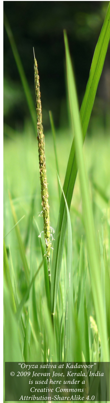
“ Oryza sativa at Kadavoor” © 2009 Jeevan Jose, Kerala, India is used here under a Creative Commons Attribution-ShareAlike 4.0

However, as long as the actual homeland of Austroasiatic speakers is not agreed upon, SE Asia cannot be set as the geographic location of early rice cultivation. However, phytolith (silica deposits in plants) studies indicate rice cultivation as early as the 4500 BCE in north and central Thailand, but evidence of domesticated rice in Thailand using macroremains dates to 2000–1500 BCE in the coastal site of Khok Phanom Di (C. Castillo, 2011).